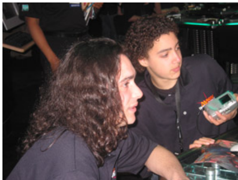
Canali and Nuijten showed their relative inexperience during the IPA Draft.

Much is written about the ability to play multiple colors in IPA due to all the green mana-fixing in the form of Fertile Ground , Quirion Elves , and the hallowed Harrow , but my favorite mana-fixers were all blue in IPA because they served double duty as mana-denial for your opponent. Dream Thrush , Reef Shaman , and even Sea Snidd are all fine and good when casting a dragon or kicking up Rakavolver , but are most often used to keep dragons and 'volvers at bay by hitting the opponent's mana during their upkeep.